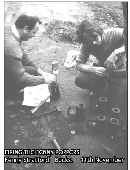
FIRING THE FENNY POPPERS Fenny Stratford Bucks. 11th November