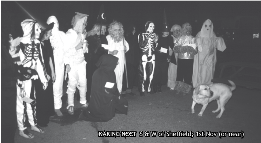
KAKING NECT S &amp; W of Sheffield; 1st Nov (or near)